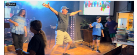
(Kids night 5/11/23)