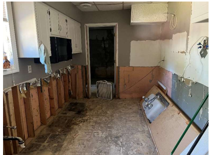
The Happy Church kitchen that feeds many people every week!

If you have financial questions, as mentioned before, feel free to drop me an email.