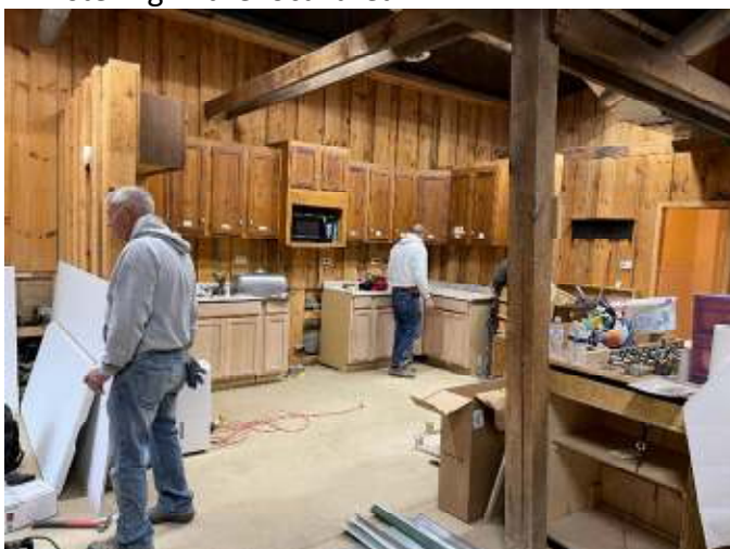
Barn Kitchen Cabinets Getting Installed

Once the repairs have been done on the church campus, we are looking to host groups that will be ministering in the local area.