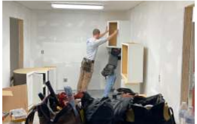
Gym Kitchen Cabinets Getting Installed

The response to the flood damage has been amazing. We have had so many churches and individuals respond to the call for help. Ninety-five percent of the construction has been completed. There is still a lot of cleaning, painting, and organizing that needs to be done. The Lord has provided many skilled carpenters and plumbers to help restore the buildings to what they were before the flood. Some improvements were also made during the process in order to make things better.