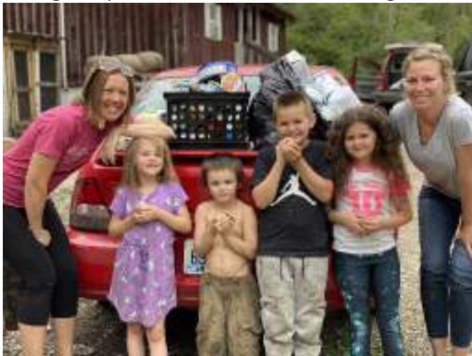
Making Deliveries of Food and Cleaning Supplies

Once the repairs have been done on the church campus, we are looking to host groups that will be ministering in the local area.